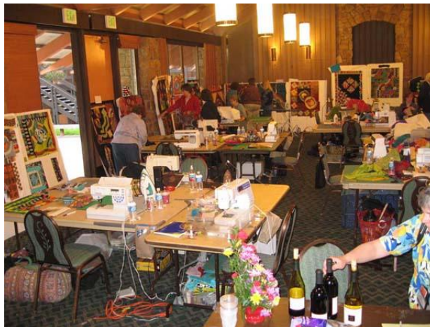
Class sample using some of the techniques & this class in progress at Asilomar 2007