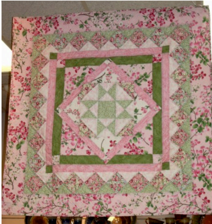
40"x40" finished size.